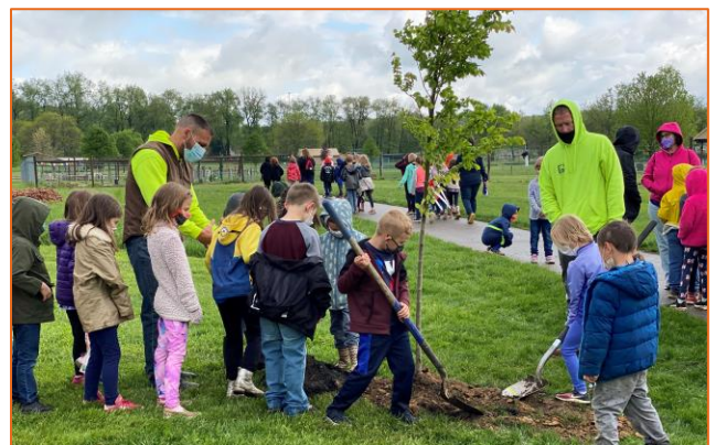
Village staff assist Wiggin Street Elementary students at the Arbor Day Tree Planting Ceremony on Friday, May 7, 2021.