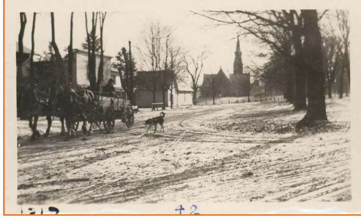
Chase Avenue, c1919