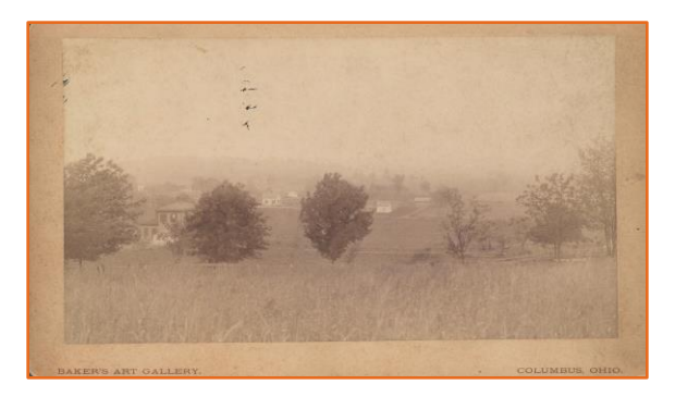
Village of Gambier, c1880

KENYON HAS ANNOUNCED PLANS TO RESUME IN-PERSON INSTRUCTION FOR FALL SEMESTER. GO TO KENYON.EDU FOR DETAILS